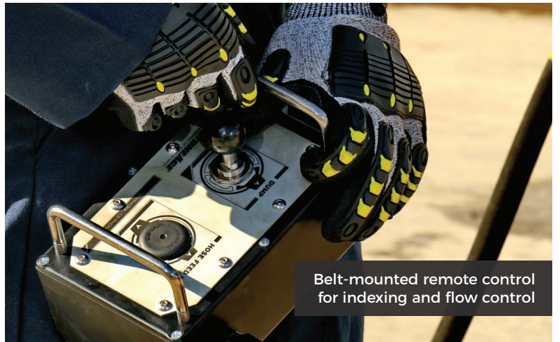
Belt-mounted remote control for indexing and flow control

The CVP system is compact, highly mobile, rigs up quickly and occupies a small area on the job site. Major components include a trailer-mounted pump, pressure control system, pig launcher and receiver. Special valving controls flow and conserves water by recirculating it back to the pump when the system is not in use.